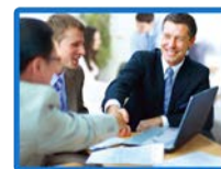
Even in small spaces