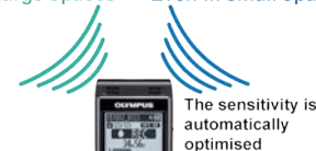
The sensitivity is automatically optimised