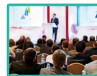
Even in large spaces