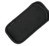
2. Carrying case (CS-131)